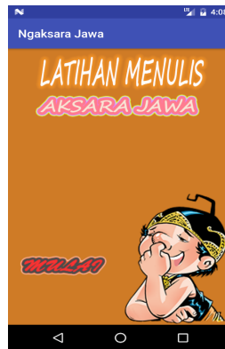
Fig. 1 Home page of application

There is an Android mobile application that has been developed which named Ngaksara Apps. The screenshot of Ngaksara Apps shown in Figure 1.