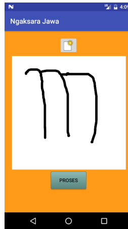
Fig 3 Canvas to write Javanese script

of the Javanese Script as can be seen in Figure 2.